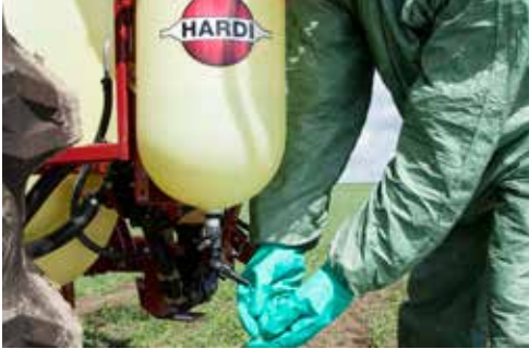
15 l CleanWater tank