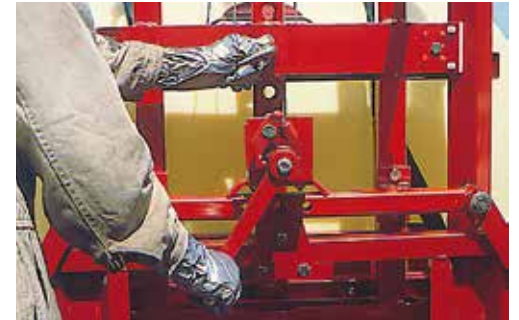
Manual boom lift