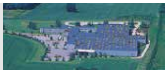
Høje Taastrup, Denmark