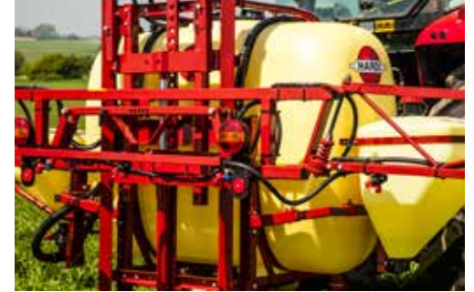
Hydraulic boom lift