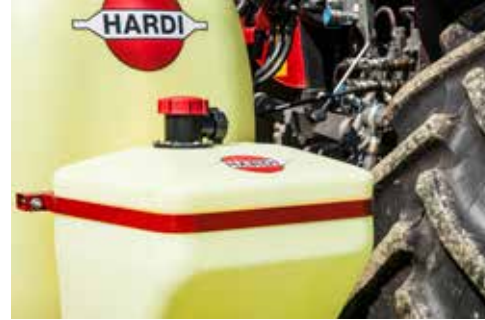
60 l RinseTank