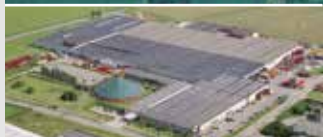
Nørre Alslev, Denmark