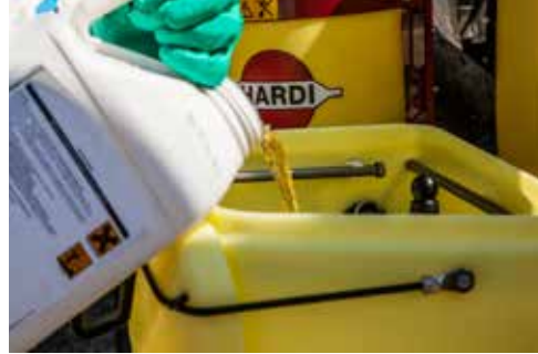
25 l ChemFiller